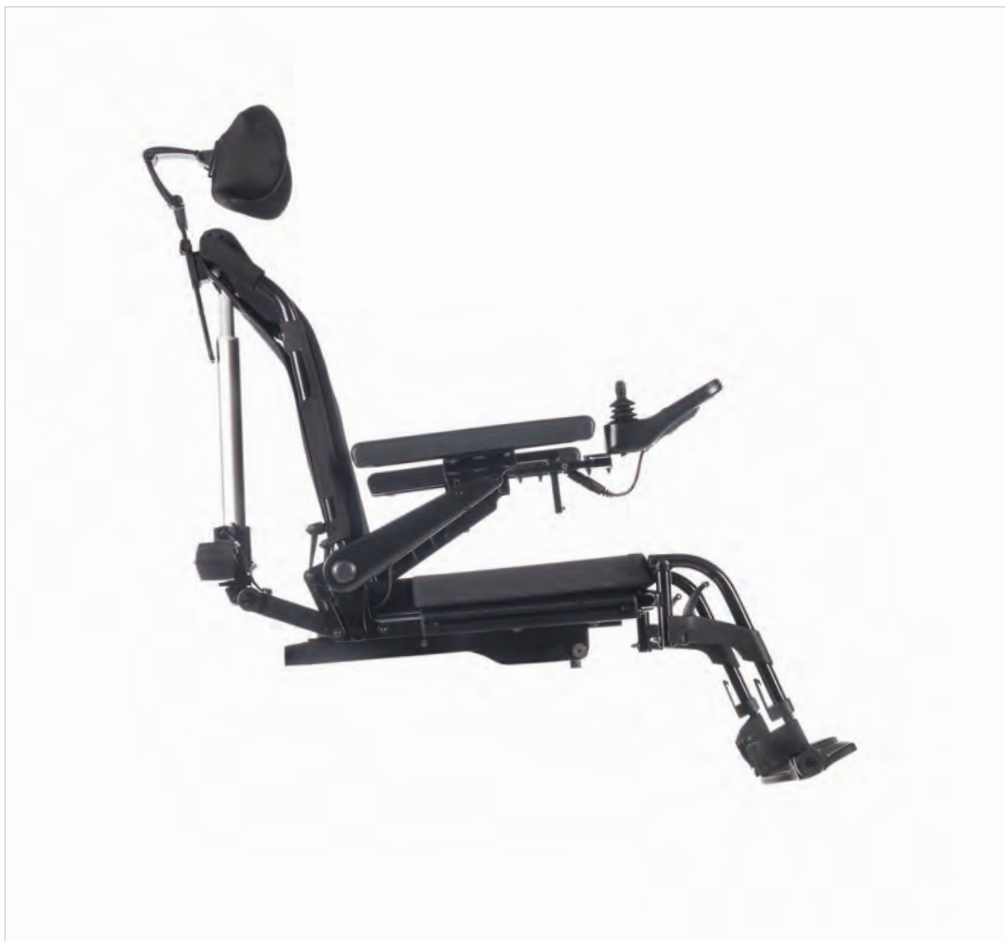
*Image showing available recline option