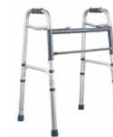
Aluminium Folding Walking Frame Small, Medium, Large Wheel and ski options available SWL 127kg