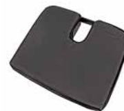
Aspire Foam Wedge Cushion GSS340140