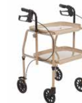
Aspire Meal Tray Walker DLG272061 SWL 125kg