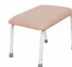
Aspire Padded Footrest CHP208080 - Champagne Vinyl CHP208085 - Slate Vinyl