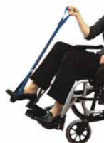
Leg Lifter DLD269390