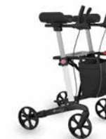
Aspire Vogue Forearm Walker WAF705400 SWL 150kg