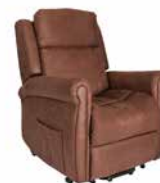
Aspire Raphael Quattro Lift Recline Chair Various sizes and fabric options SWL 130kg – 180kg