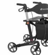
Aspire Vogue Carbon Fibre Seat Walker WAF705350 - Medium WAF705360 - Tall SWL 150kg