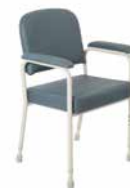
Aspire Low Back Classic Day Chair CHP208000 - Champagne Vinyl CHP208005 - Slate Vinyl SWL 160kg