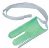
Terry Cloth Sock Aid DLD269090