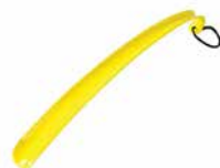
Aspire Shoe Horn DLD269160