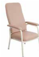
Aspire High Back Classic Day Chair CHP208050 - Champagne Vinyl CHP208055 - Slate Vinyl SWL 160kg